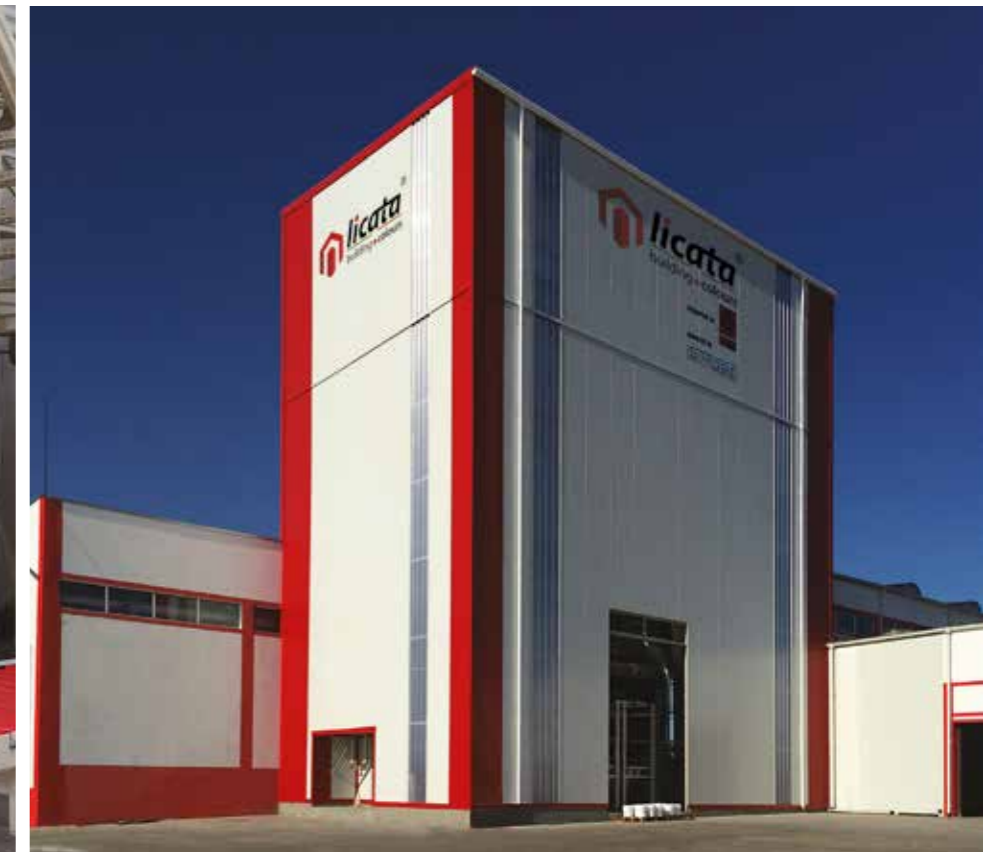
• Burgas plant (Bulgaria)