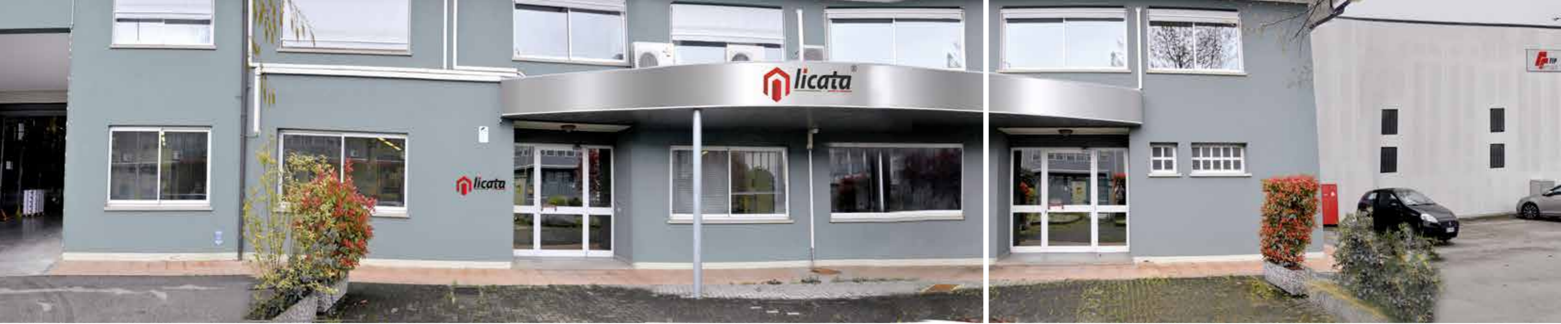
• Teolo plant (PD)