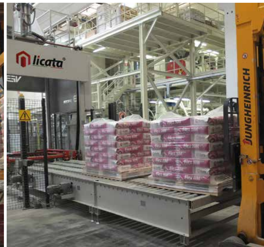
• Canicattì plant (AG)